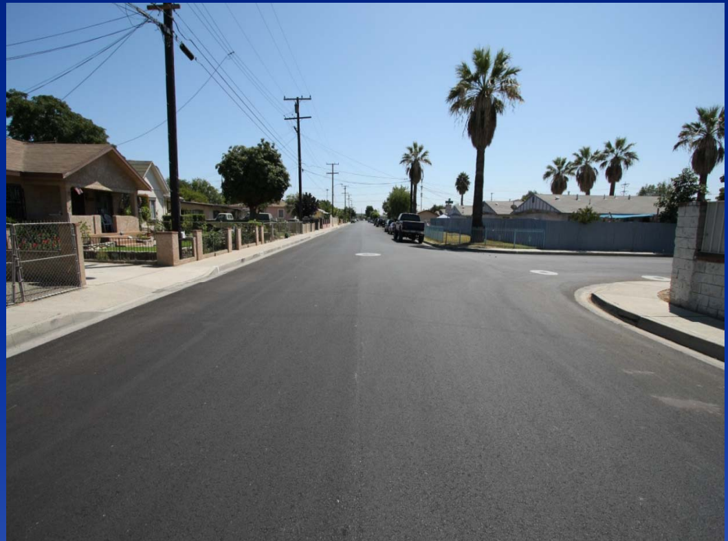
FINAL CIR PAVEMENT ON EVERGREEN AT FLORA