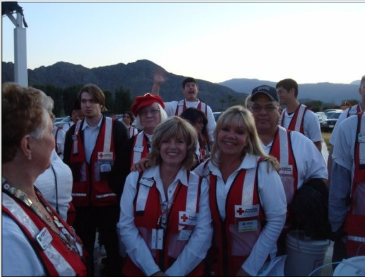
American Red Cross volunteers preparing to canvass the Indian Wells Tennis Garden for donations as part of "Hit for Haiti."