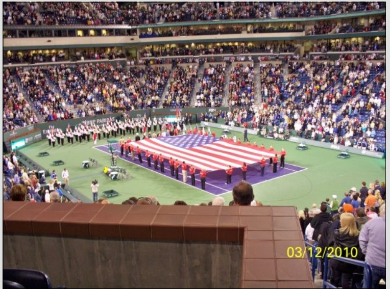
Prior to the event's start, the tennis garden audience paid tribute to servicemembers and law enforcement personnel.

Editor's Note: On March 12, the BNP Paribas Open hosted "Hit for Haiti," an exhibition tennis match featuring Roger Federer, Rafael Nadal, Pete Sampras, Andre Agassi, Steffi Graf, Lindsay Davenport, Martina Navratilova and Justine Henin at the Indian Wells Tennis Garden.